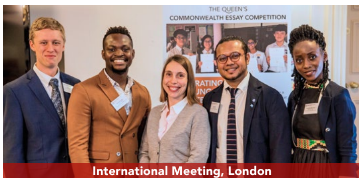
International Meeting, London