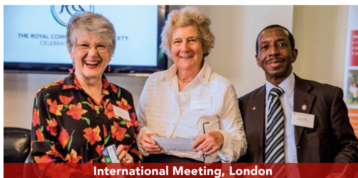
International Meeting, London