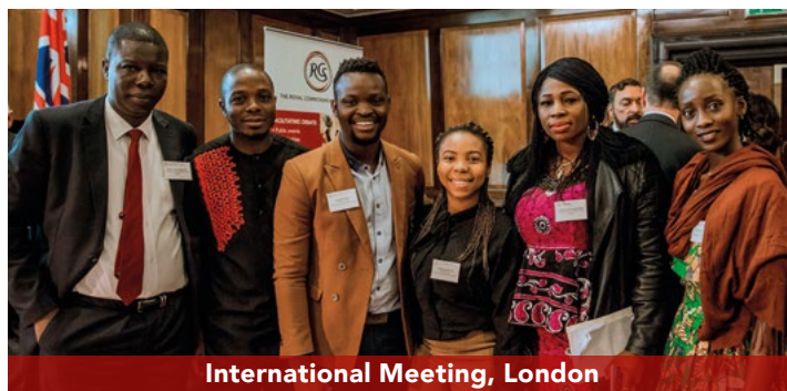
International Meeting, London

RCS Branches and Associate Fellows celebrate the 150th anniversary of The Royal Commonwealth Society.